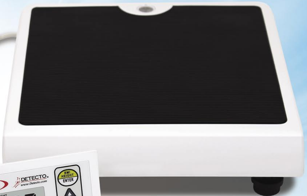
Detecto Model PD100 Low-Profile Physician Scale with Body Mass Index