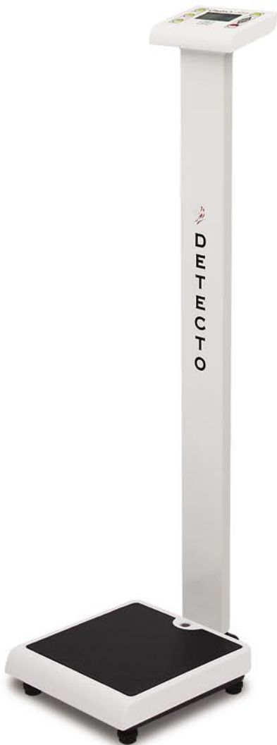
Model PD300 Eye-Level Physician Scale with Body Mass Index

The optional P50 direct thermal printer may be mounted on any of the ProDoc® PD300 series eye-level physician scales to print Time, Date, Height, Weight, and Body Mass Index. The P50 features two-button operation and RS-232 serial communication with the scale (cable included with printer).