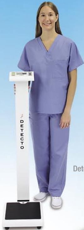
Detecto Model PD300

MEDICAL GRADE ACCURACY: WEIGHT • HEIGHT • BMI