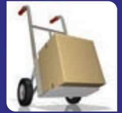
Easy roll on and roll off