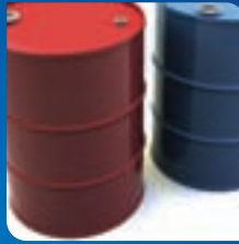
Easily weigh drum barrels and industrial containers