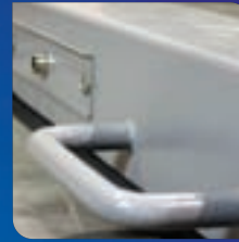
Built-in handles for portability