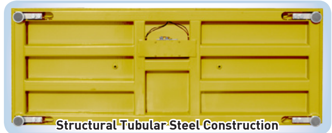
Structural Tubular Steel Construction