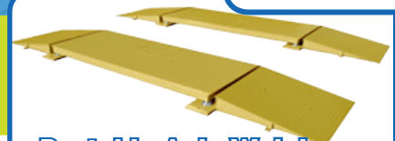
Portable Axle Weighers with Ramps