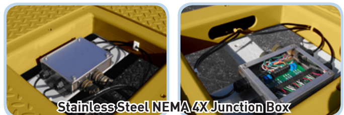
Stainless Steel NEMA 4X Junction Box