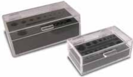
Shown with optional insert