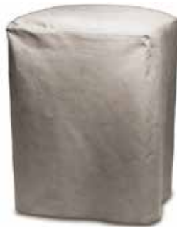
Canvas Dust Covers