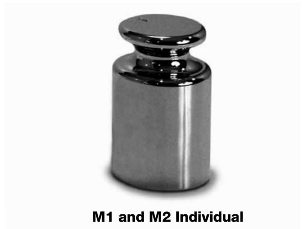
M1 and M2 Individual

Central Carolina Scale, Inc. To order, call (919) 776-7737 Email: info@centralcarolinascale.com We accept all 4 major credit cards