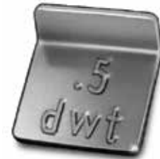
Leaf PN 12693