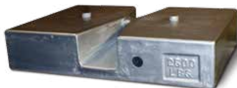
Nesting Slab PN 12860